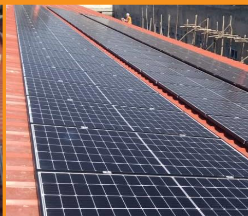
Installation of solar at SOS Children's Village-Abaita in Entebbe