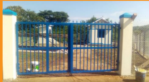
Pump house & fence construction for Kabwasa Community Solar powered Water System