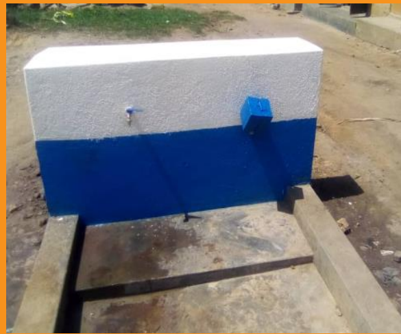
Construction of PSPs