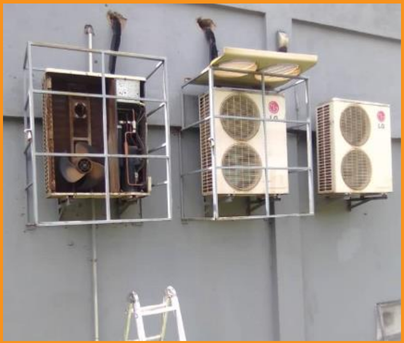
Installation and servicing of AC units of Aseptic lab