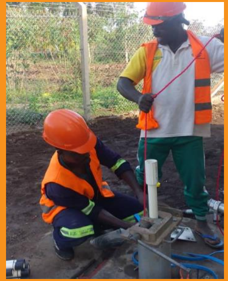
Borehole and pump installation for Kabwasa PWSS