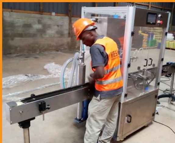
Installation of liquid filling machine