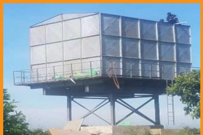
Ngoma Water Supply System in Nakaseke District