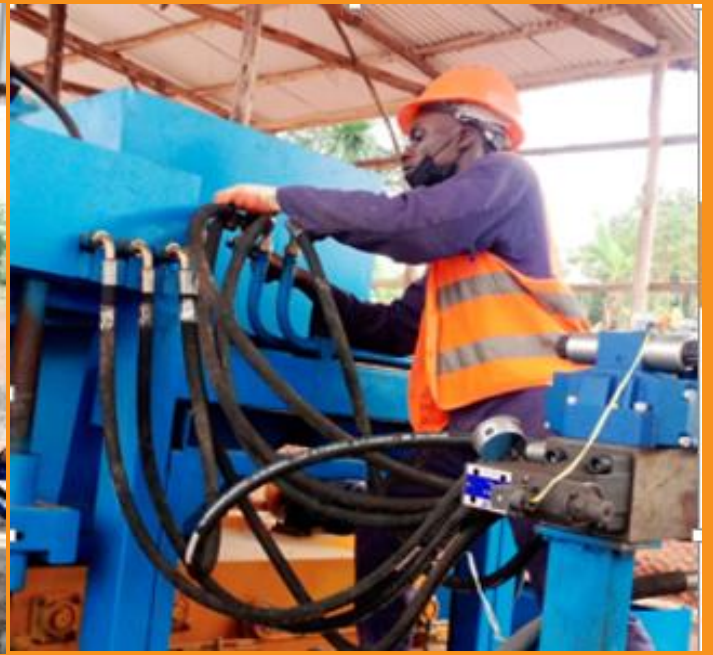
Concrete making machine-Busikiri Wakiso