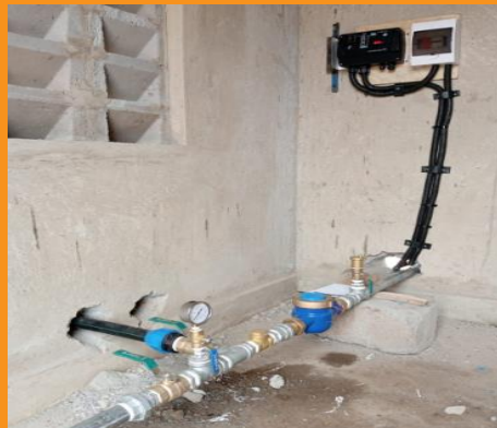
Plumbing works in pump house