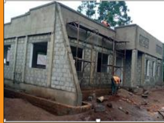
Library at Mater Ecclassie Nursing School Luwero