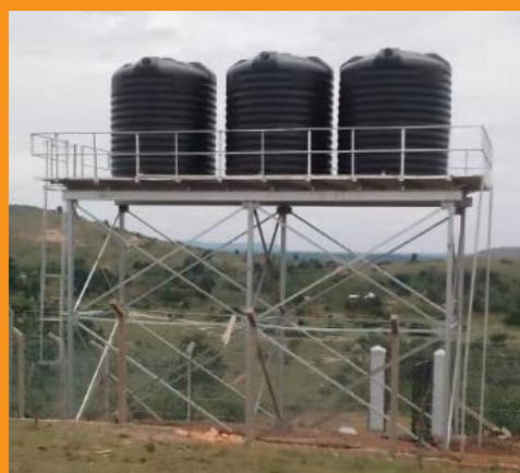
Construction of 30 cubic water tank