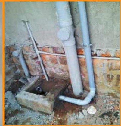
Plumbing and drainage works for Mater Ecclessie nursing school