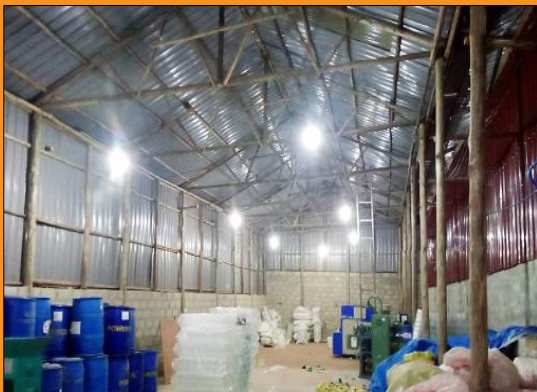
Pet bottle making machine Installation & wiring