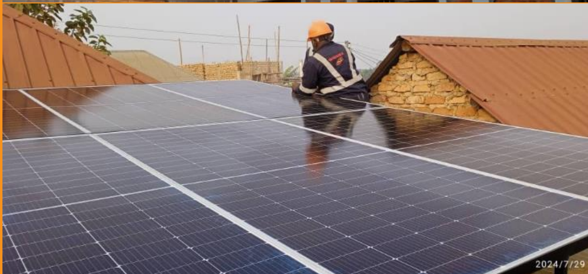
Solar works at Celebrate Hope Ministries in Kyotera District